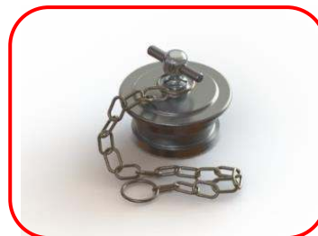
105-A-BLC10007 Male IN 70mm Non- Pressure Release LA