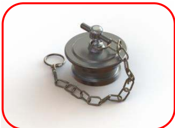
105-A-BLC10002 Male IN 70mm Pressure Release LA