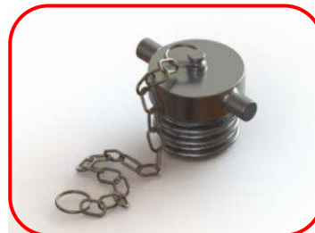
105-A-BLC10004 65mm MRT Blanking Plug LA