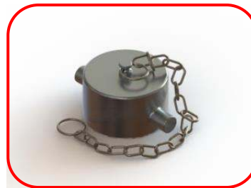
105-A-BLC10005 65mm FRT Blanking Plug LA