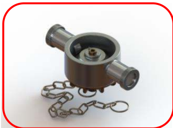
105-A-BLC10001 Female IN 70mm Pressure Release LA

All male and female blank caps come with chain to secure