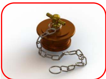
105-A-BLC10003 Male IN 70mm Pressure Release LG2